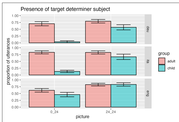
Fig. 2. Rates of expressions containing the relevant determiner (i.e., negative indefinite/universal quantifier) in the subject role. Vertical bars represent standard error.

Sel. Refs.: Anderson (2004). The structure and real-time comprehension of quantifier scope ambiguity. PhD Thesis Northwestern University . • Bill, Yatsushiro & Sauerland (2019). Asymmetries in Children’s Negative